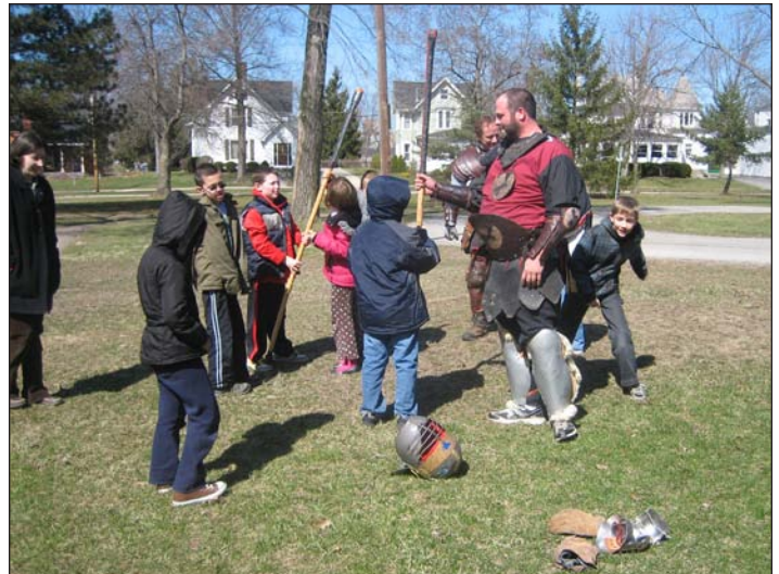
Medieval Europe Campers immersed themselves in creating kingdoms and building castles, with guests Argh and Sir Dougal .